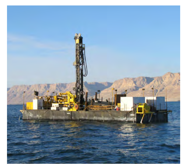
Fig. 4.2.4: DLDS on Dead Sea

The diamond wireline drilling technique utilizes various special coring tools and can reach depths up to 1400 m depth (CHD 134 string) in 400 m water depth. The DLDS is a complex and modern drilling unit, which requires a crew of experienced, welltrained technicians and engineers for drilling and marine operations on a 24/7 basis (Fig. 4.2.4).