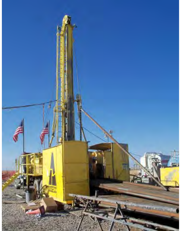
Fig. 4.2.2: Truck-mounted wireline coring rig at Snake River Plain (Project HOTSPOT)

In several shallow to medium deep ICDP projects, diamond wireline coring has been utilized very successfully. For example, in the Snake River Plain HOTSPOT project in Idaho, USA, three almost 2000 m deep wells were drilled with this technique. A wireline coring rig (Fig. 4.2.2) was used that can deploy 1000 m of PQ, 1500 m HQ or 2500 NQ drill string.