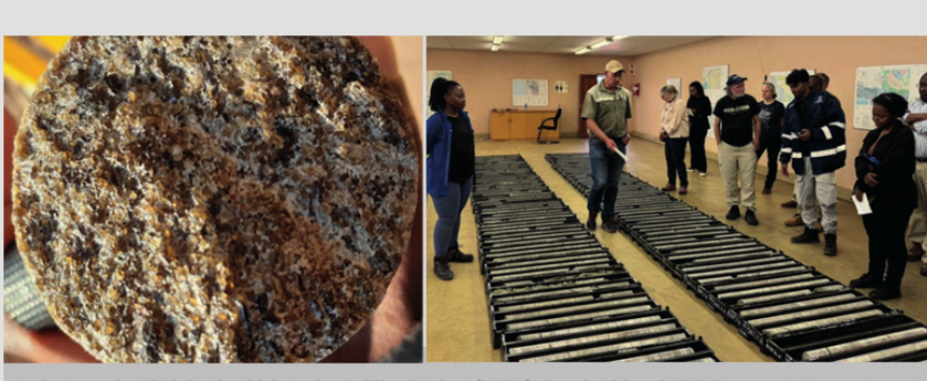
Cores at the ICDP Bushveld Complex Drilling Project (BVDP), South Africa

The BVDP drilling project team has successfully overcome the challenges posed by an extremely brittle lamprophyre dyke. Drilling has now advanced beyond 1,600 meters, reaching a major lithological change this week. Excellent work!