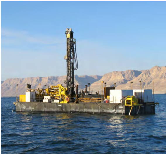
Fig. 4.2.4: DLDS on Dead Sea

The diamond wireline drilling technique utilizes various special coring tools and can reach depths up to 1400 m depth (CHD 134 string) in 400 m water depth. The DLDS is a complex and modern drilling unit, which requires a crew of experienced, well-trained technicians and engineers for drilling and marine operations on a 24/7 basis (Fig. 4.2.4).