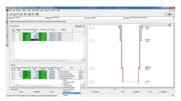
Fig. 4.2.14: Casing design and calculation template from Sysdrill well planning & engineering suite.

pressure imbalances; the latter includes well-kicks or mud losses and the analysis of the well production phase after drilling under different temperature and pressure conditions; 3) graphical plots, tabular data and traffic light pass/fail indicators should allow rapid identification of problematic loading conditions.